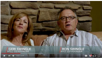
ADVANCE Promo Video (Click Image to Watch)

Christ Church Santa Fe (CCSF), a congregation of 200 people, located in Santa Fe, New Mexico asked Hidden Treasure Coaching and Consulting (HTCC) to partner with them in delivering a Saturday workshop centered on building up the married couples in the church – an event we call ADVANCE!.